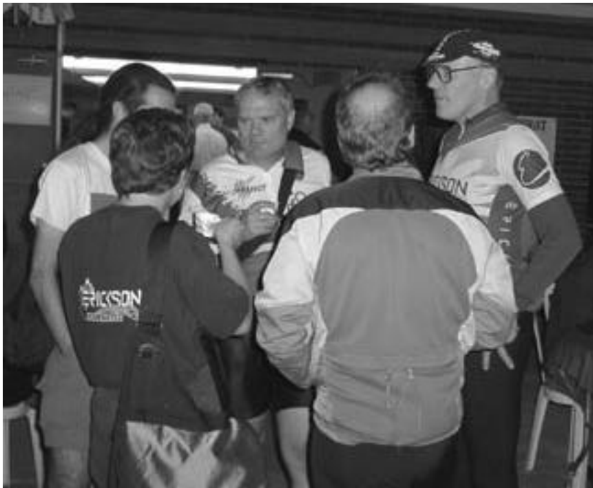
Drinking Greek Coffee