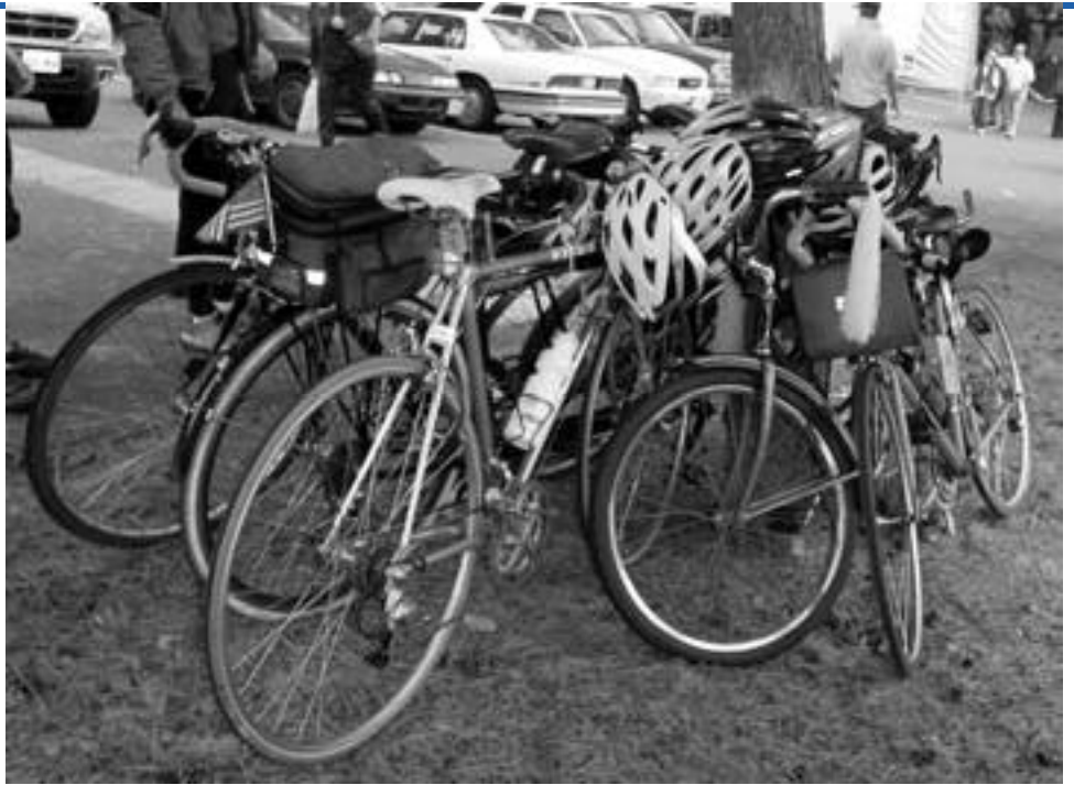
The bikes holding up that tree....Notice the string of helmets!